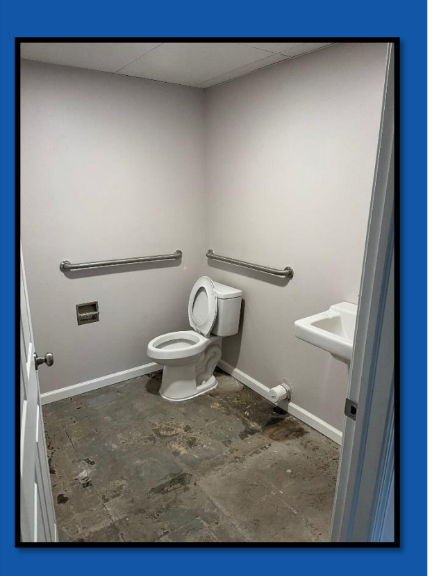
1,200 +/- SF Available